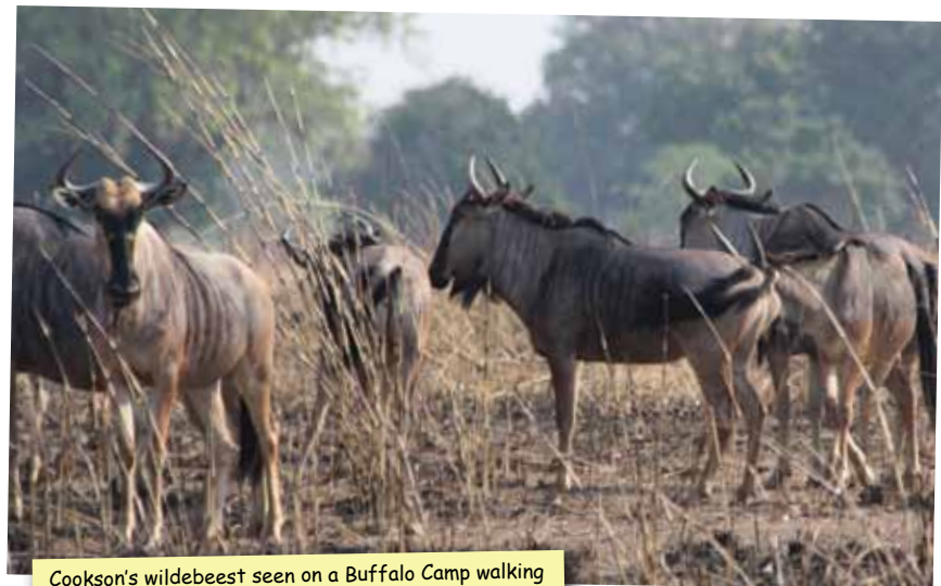
Cookson's wildebeest seen on a Buffalo Camp walking safari in the north area of Kafue National Park.