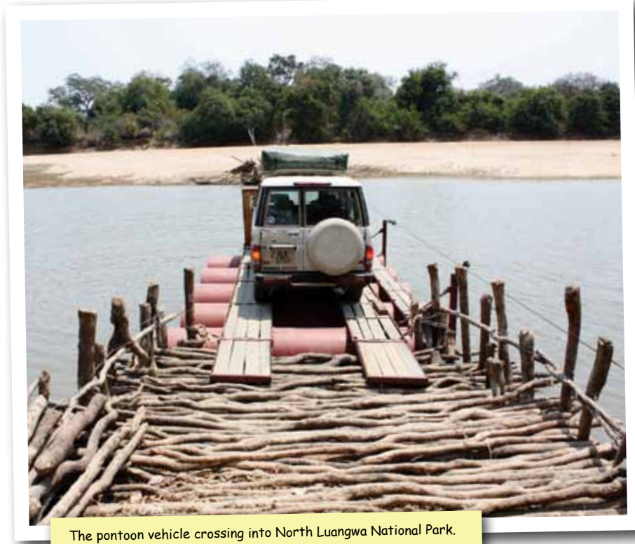
The pontoon vehicle crossing into North Luangwa National Park.

The chance to see the rare sitatunga in the swampland means a stopover