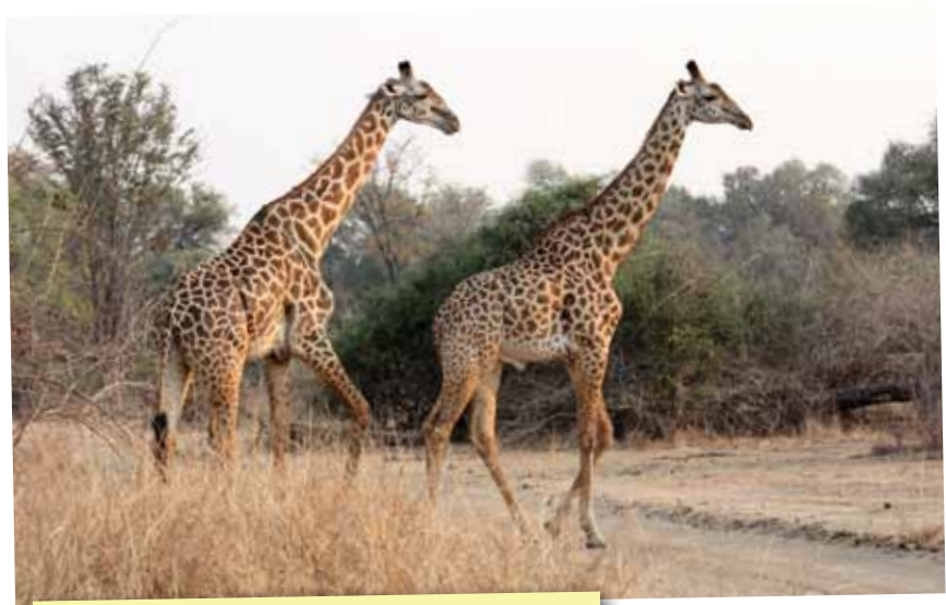
Thornicrofts giraffe in South Luangwa National Park.

In the dry season it is possible to drive north on a good sandy road surrounded by mopane woodland alongside the eastern border of SLNP through the Lupande and Lumimba Game Management Areas. Between the two is a small area of SLNP known as the Nsefu sector and while passing through it two female lions were seen prowling through the bush. The road leads into the 245 km 2 Luambe National Park. This park is managed on behalf of ZAWA by Luangwa Wilderness e.V. a private charitable organisation who have built Wilderness Lodge, which also boasts a camping site overlooking the Luangwa river and with a large resident hippo pod. Although it is only 240 km between South and North Luangwa National Parks, a stop-over at the Lodge offers the self drive traveller a real feel of being in the wilderness. However, on driving round one of the game trails,