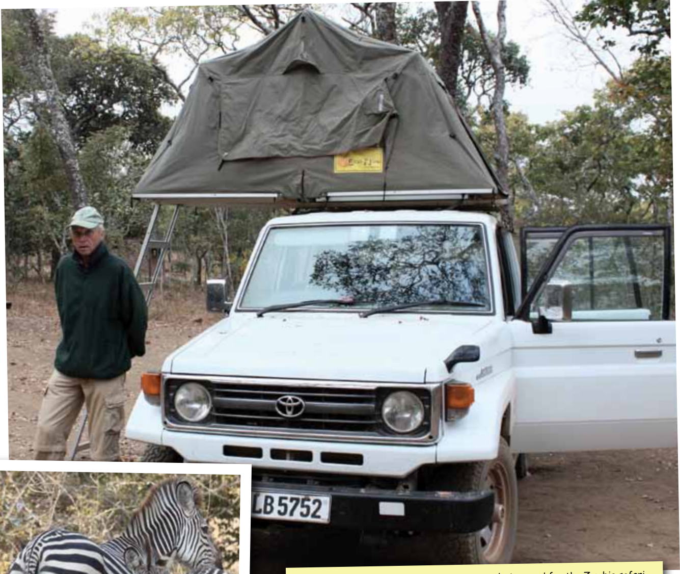
The author with the transport and accommodation used for the Zambia safari.