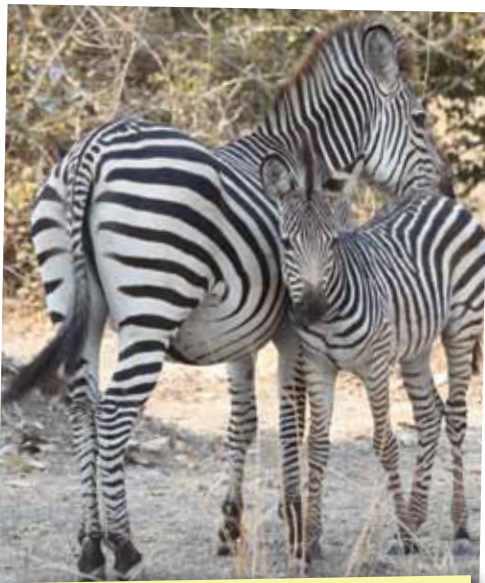
Crawshaw's zebra in South Luangwa National Park.

Their very informal, laid back approach would not suit everyone. Lions are their passion and can often be heard at night with a chance to follow the tracks next day on foot. Poaching is a problem in the Park and three lions were found with snare wounds that needed veterinary treatment. During