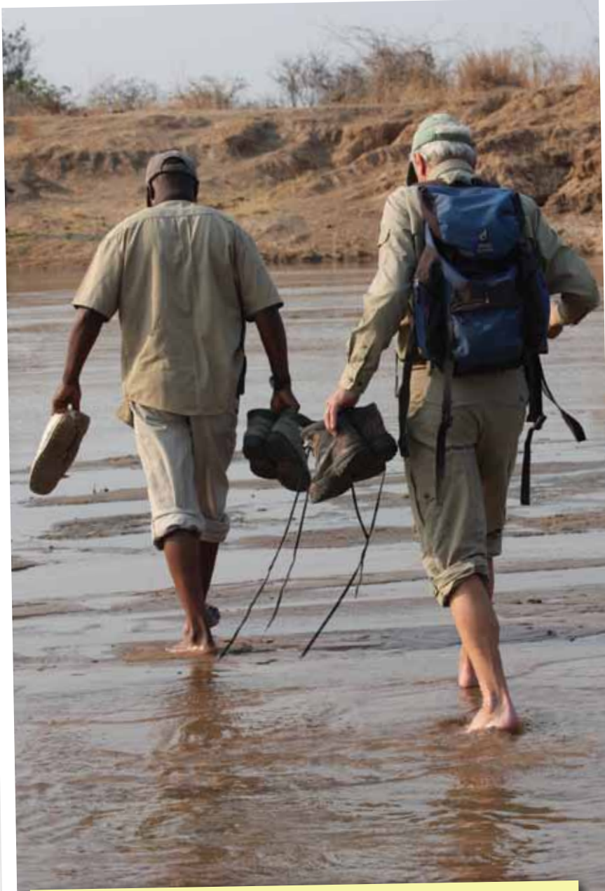
Crossing the river on a Buffalo Camp walking safari in North Luangwa National Park.

For a safe, self-drive safari, Zambia has a lot to offer. If you have a spirit of adventure but do not want to take unnecessary risk, travelling around the country and between wildlife areas in the dry season is ideal. Arriving at Lusaka airport by Kenya Airways from Nairobi, a double cab Toyota Landcruiser with rooftop tent and camping equipment was ready and waiting courtesy of Limo Car Hire. The rest of the day was spent stocking up with food and drink, getting used to driving the automatic car, erecting the roof top tent and identifying what more camping equipment was needed.