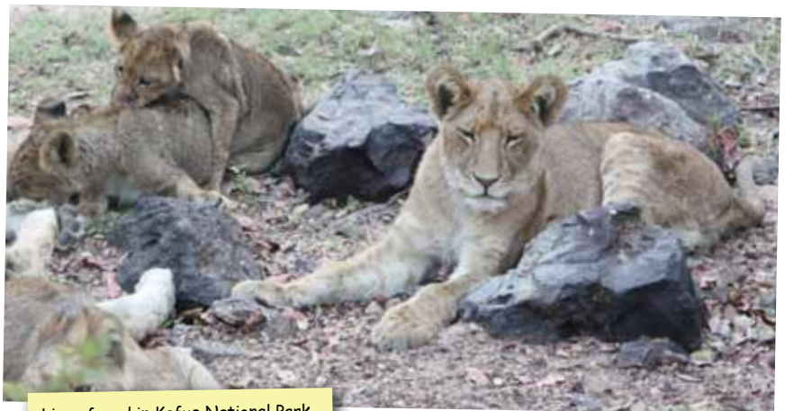
Lions found in Kafue National Park.

To go from Buffalo Camp to the north of the Park through to Mano Gate