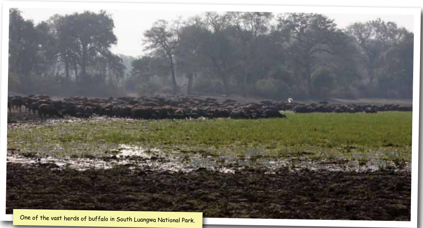
One of the vast herds of buffalo in South Luangwa National Park.