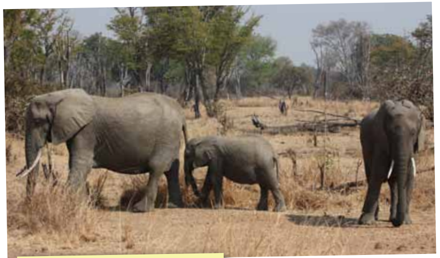
Elephant family in Luambe National Park.